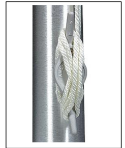
Heavy Duty Cleat